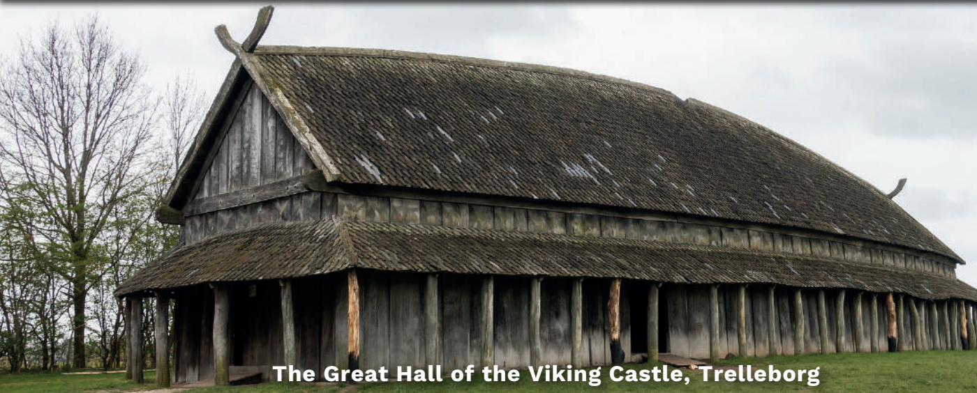
The Great Hall of the Viking Castle, Trelleborg